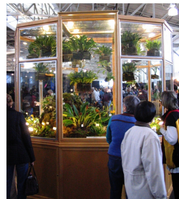
From Last Years Pacific Orchid Exposition