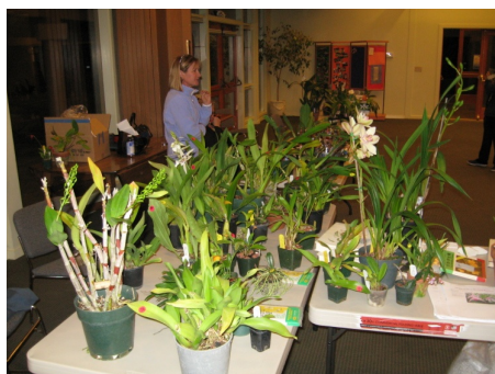
Scenes from the February orchid flea market.